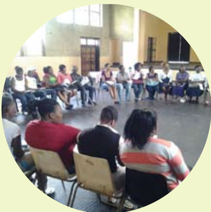
Attendees 16 days of activism

O n 5 October 2012 ProBono.Org in partnership with Community of the Victim Support held a workshop that was aimed at empowering women on domestic violence. The workshop was held at the Community Hall in Meadowlands. 52 people attended.