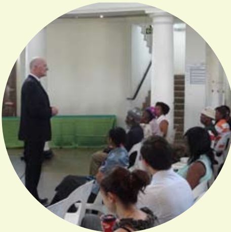
Housing Day. Justice Cameron

This special gathering took place on a beautiful sunny day at the Women's Jail Atrium at the Constitution Hill. Large numbers of people turned up to obtain pro bono legal assistance and receive education and advice at an event organised by ProBono.Org to coincide with UN World Habitat Day, which is normally celebrated on the first Monday of every year of October. Justice Edwin Cameron opened the proceedings by focussing on the section 26 right to adequate housing that is enshrined in the South African Constitution. After speaking at length about some of the key Constitutional Court housing judgements, and relating them to current housing issues, he re-iterated the 51 Olivia Road v City of Johannesburg and Blue Moonlight case which held that in the event of an eviction the government should engage with the affected individuals in a meaningful manner in order to find a solution.